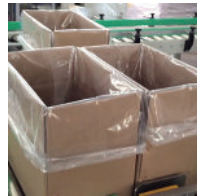
Auto Insert Bags