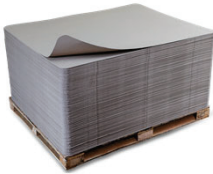
Plastic Slip Sheeting