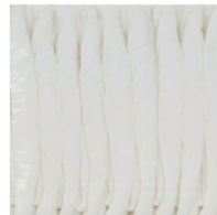
Secondary Package Bags