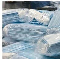
Primary Package Bags